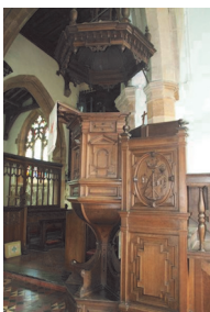
Pulpit in Canons Ashby Church

Please note the date Sunday 22 September 2013 in your diaries! Details are not finalised yet, but there is a distinct possibility that we are to sing Evensong at Canons Ashby Church in Northamptonshire on that date.