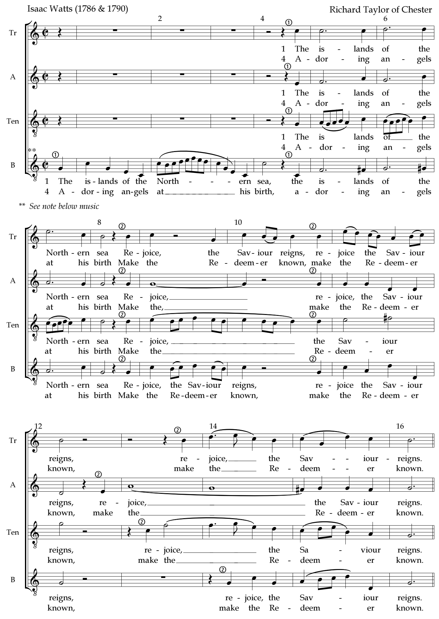
Psalm 97 vv. 1, 3, 5~7, 11. (Christ's incarnation, and the last judgment.)